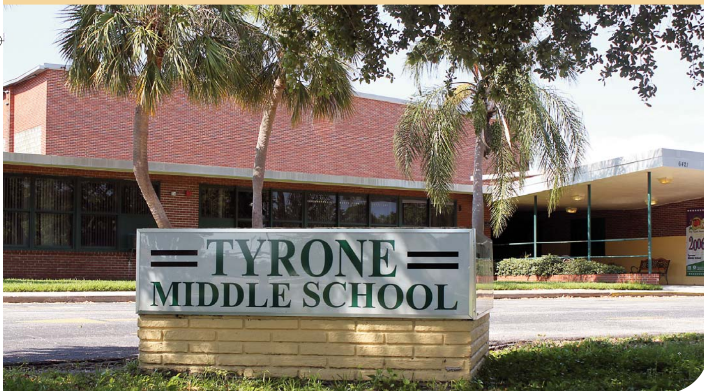
Tyrone Middle School

Magnet programs focus on a certain theme with specialized curriculum in areas such as arts, communication, science and technology, and gifted studies. Some programs have eligibility requirements.