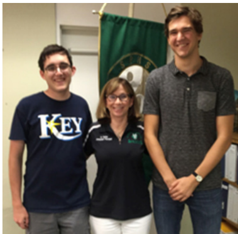
program entrants. The nationwide pool of Semifinalists, representing less than one

About 1.5 million juniors in more than 22,000 high schools entered the 2016 National Merit Scholarship Program by taking the 2014 Preliminary SAT/ National Merit Scholarship Qualifying Test, which served as an initial screen of